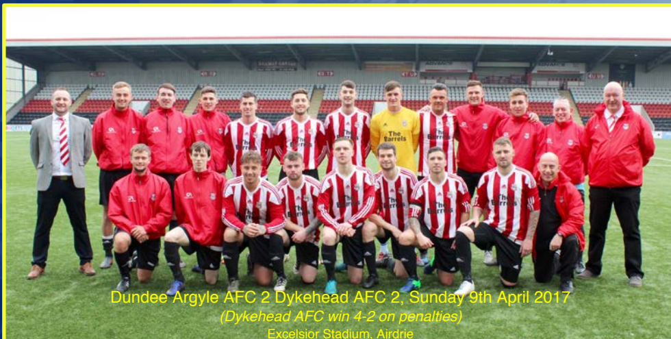
Dundee Argyle AFC 2 Dykehead AFC 2, Sunday 9th April 2017 (Dykehead AFC win 4-2 on penalties) Excelsior Stadium, Airdrie