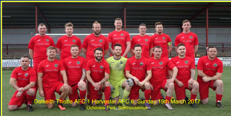
Dalkeith Thistle AFC 1 Harvester AFC 6, Sunday 19th March 2017 Ochilview Park, Stenhousemuir