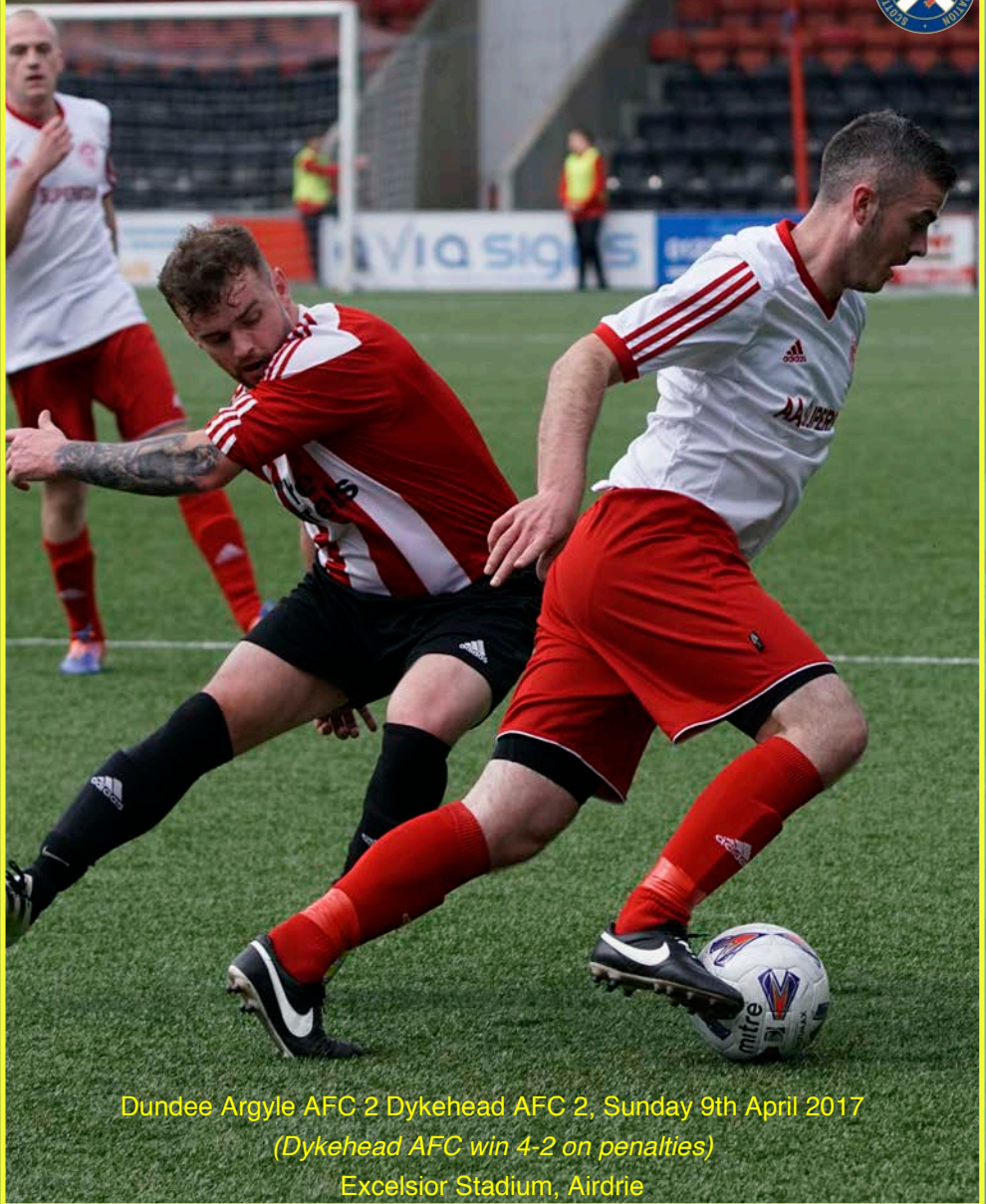
Dundee Argyle AFC 2 Dykehead AFC 2, Sunday 9th April 2017 (Dykehead AFC win 4-2 on penalties) Excelsior Stadium, Airdrie