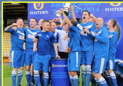
Harvester AFC Winners in 2014.

All management and players at Harvester AFC hope to contribute to an entertaining match for all you fans attending the game today and thank you for your support as always.